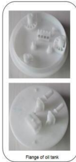
Flange of oil tank